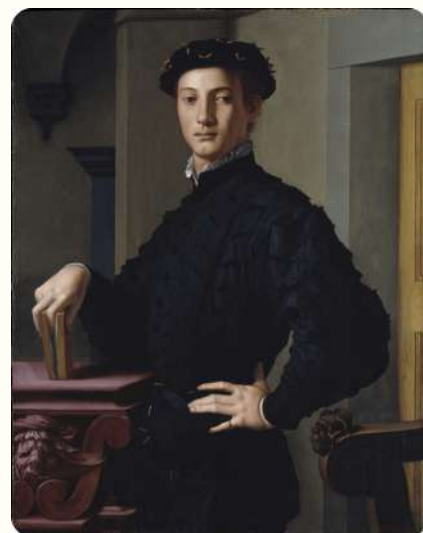
Portrait of a Young Man Agnolo Bronzino, 1530s Metropolitan Museum, NY